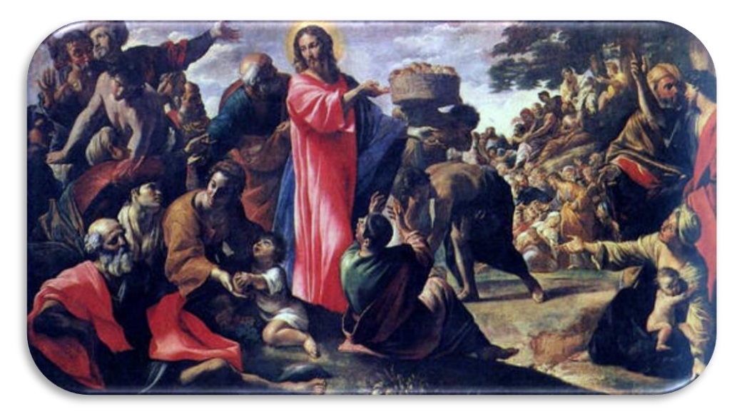
Sunday, July 25, 2021 Ninth Sunday after Pentecost 9:30 a.m.

Welcome: "How awesome is this place! This is none other than the house of God, and this is the gate of heaven!" (Gen. 28:17). Welcome to all. May we so experience the presence of God that