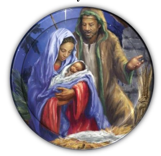
Sunday, December 26, 2021 First Sunday after Christmas A Christmas Celebration