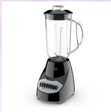
a measuring cup