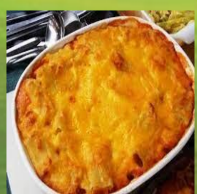
Food time! You must be hungry now. Before we eat, remember to thank God. Let us say our grace and thank God.